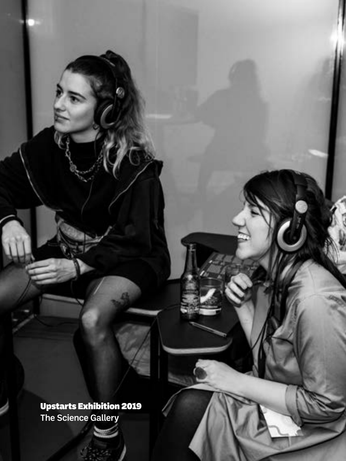
Upstarts Exhibition 2019 The Science Gallery