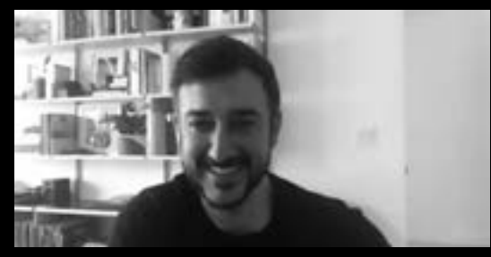
2021 Online Events Zoom