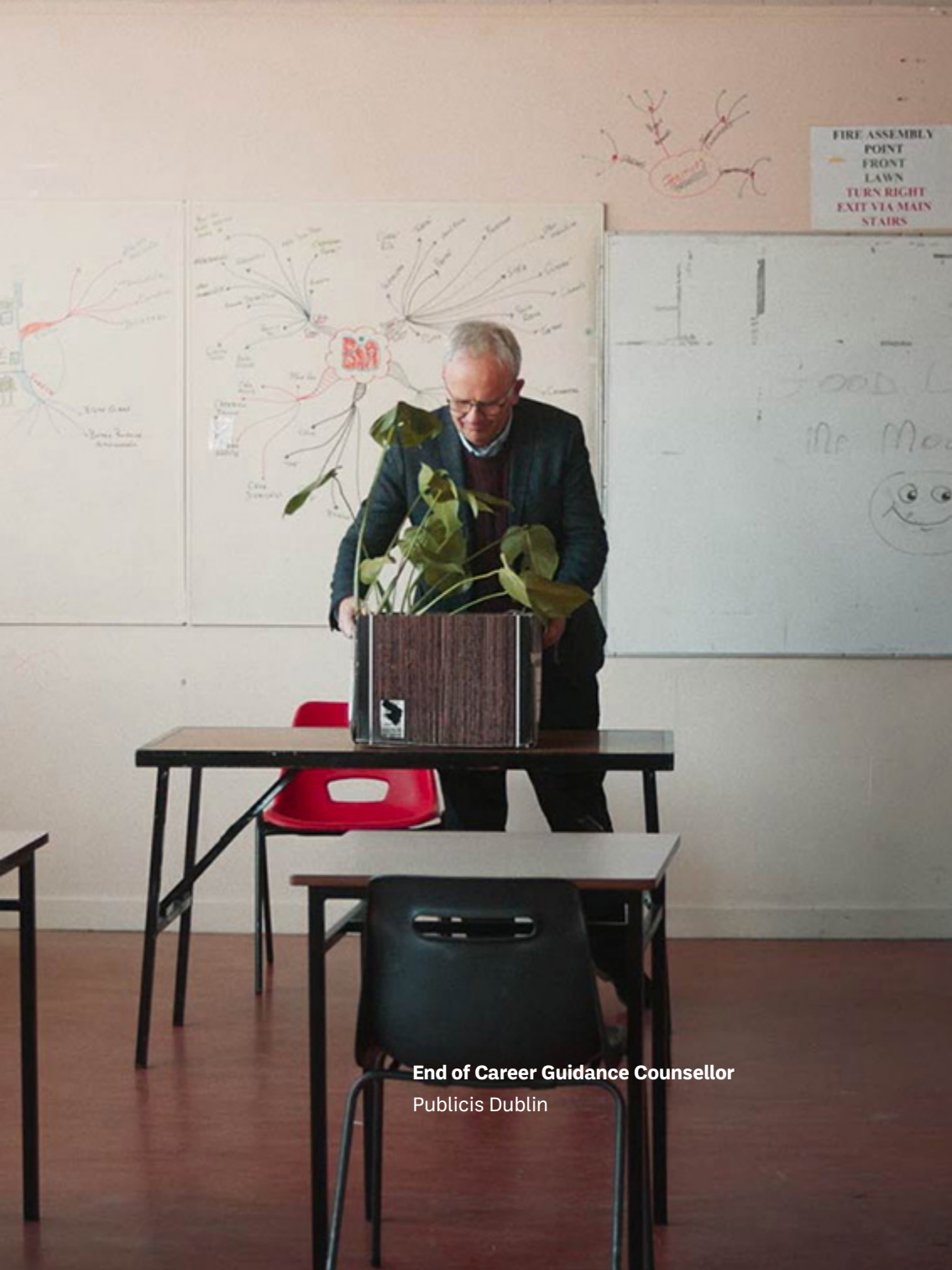
End of Career Guidance Counsellor Publicis Dublin