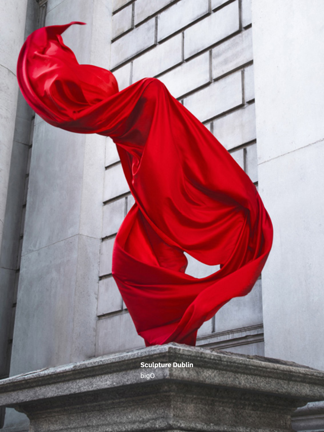
Sculpture Dublin bigO